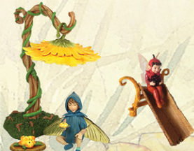
Choose your Flower Fairies™ and accessories